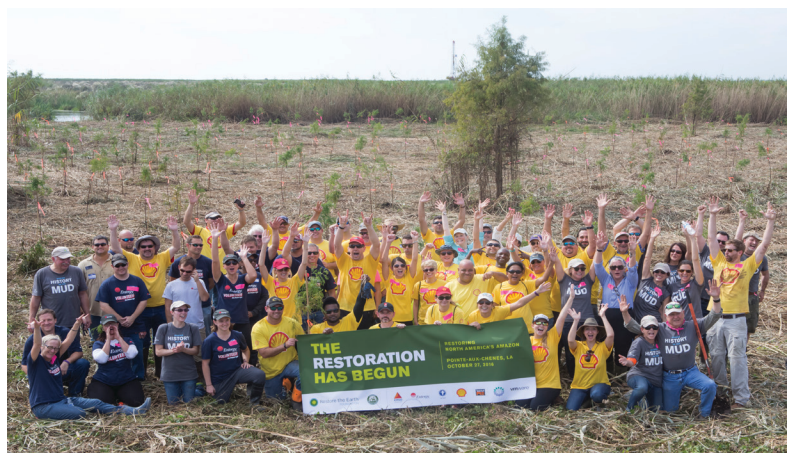
Volunteers from partner organizations joined Restore the Earth for the groundbreaking at Pointe-aux-Chenes